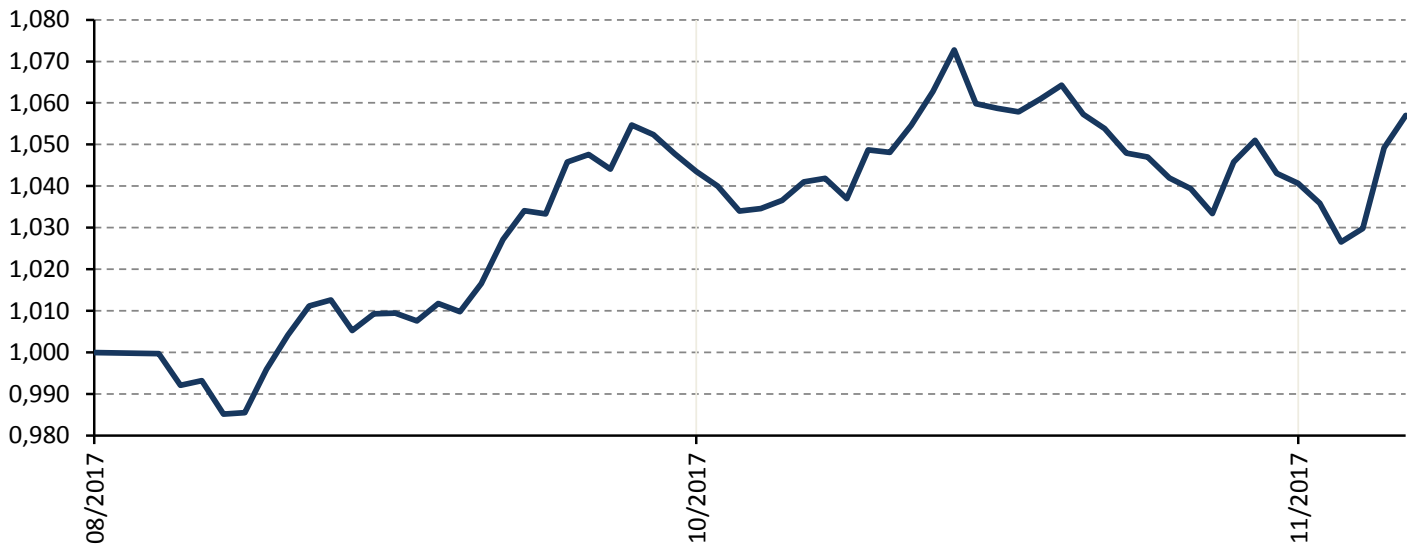
Fund unit value development

It is our duty under the legislation governing collective invesments to warn investors that any past performance of the Fund shall not guarantee identical performance also in future. The value of investments and their yields may fluctuated and there is no guarantee of return of the original invested amount. Investments in collective investment funds (UCITS) are not covered by insurance applicable to bank deposits. The full names of the funds and additional information, including information about fees and risks contained in investments, are available at www.rfis.cz , the Key Investor Information, and the Fund Prospectus.