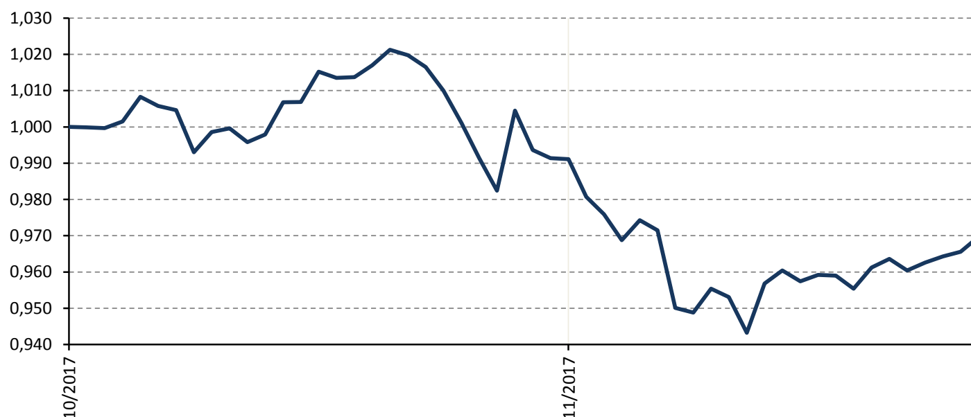
Fund unit value development

Recommendation: The Fund may not be suitable for investors who intend to recover their invested funds within a term shorter than 10 years.